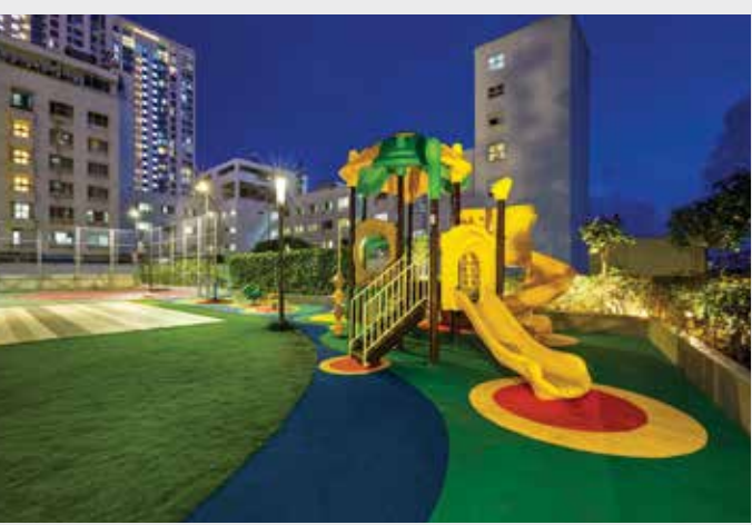
Actual views | shot at location