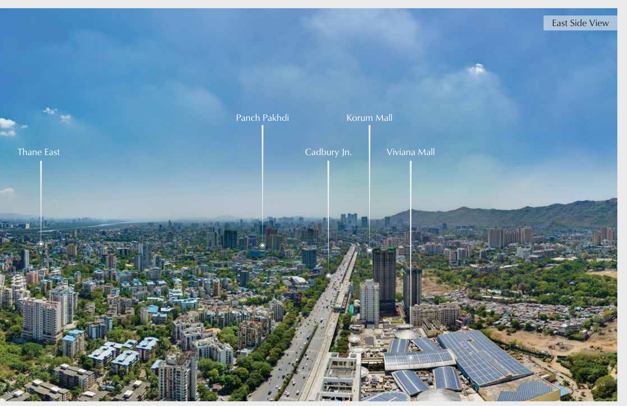
Actual view | Shot at location